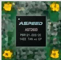
AST2600 Remote Management Server Processor